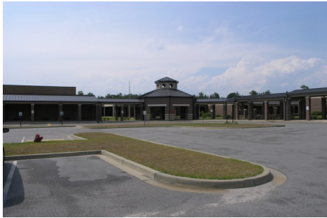
Pelion Elementary School

The mission of Pelion Elementary School, is to inspire students to reach their goals through academics, leadership, technology, and the arts. This will prepare them to be caring and independent citizens so that they realize their worth and potential while learning to help and serve others.